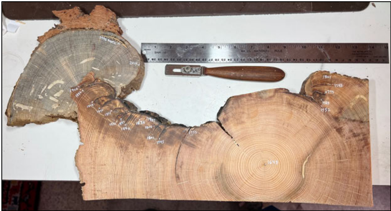
Figure 2. The re-sectioned Horseshoe Springs sample showing 17 different fire scar dates. Pith date 1643, bark date 2014. In addition to the fire scars, a pitch pocket that was probably caused by a failed bark beetle attack is visible in the left lobe of the healing curl in the 1996 tree ring.

After cutting the section, it was possible to see at least 8 more fire scars that were completely grown over by ring growth.